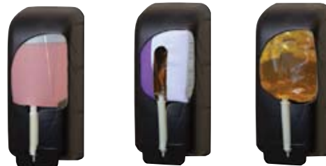
Universal dispenser E accommodates bag, bulk or bag-in-box liquid soaps.